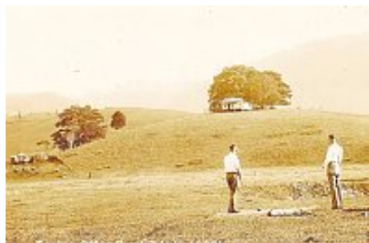
WATCH THE COWS: Golfers prepare to tee-off on the old Dunbible course.