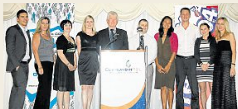
BUSINESS'S BEST: 2011's Creek to Creek Chamber of Commerce award winners.

MyCareer .com.au incorporating search 4 jobs