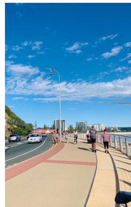
Completed Kirra boardwalk renewal project

Replacement of Kirra boardwalk is now complete. The architectural concrete structure has a 100 year life span and the feature lighting under the new railings looks spectacular. I may be biased but this stretch of road has one of the most outstanding views in our country.