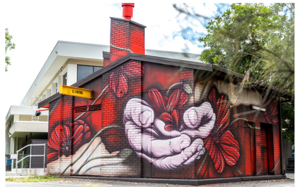
Water Walls mural, Currumbin